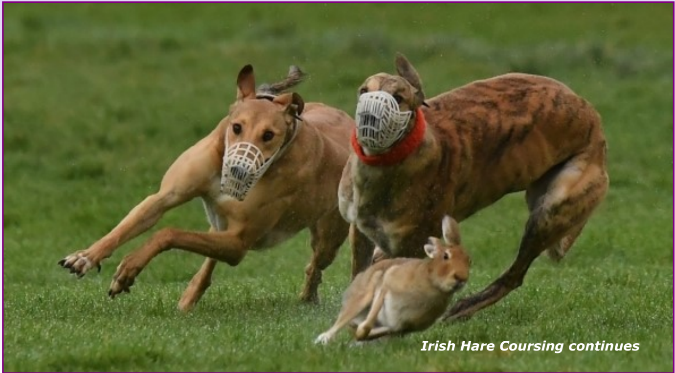
Irish Hare Coursing continues