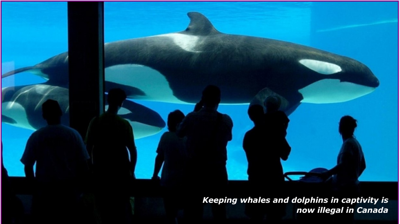
Keeping whales and dolphins in captivity is now illegal in Canada