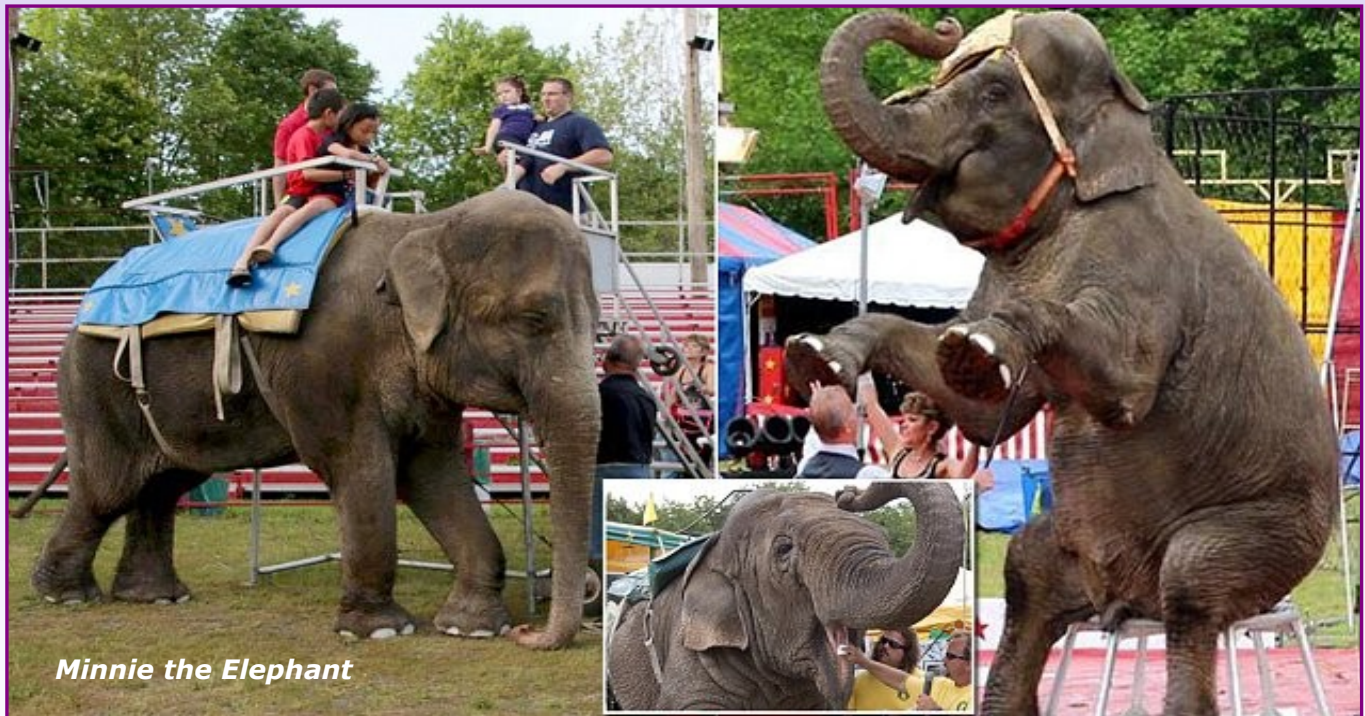
Minnie the Elephant