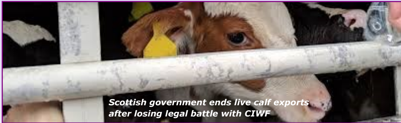
Scottish government ends live calf exports after losing legal battle with CIWF