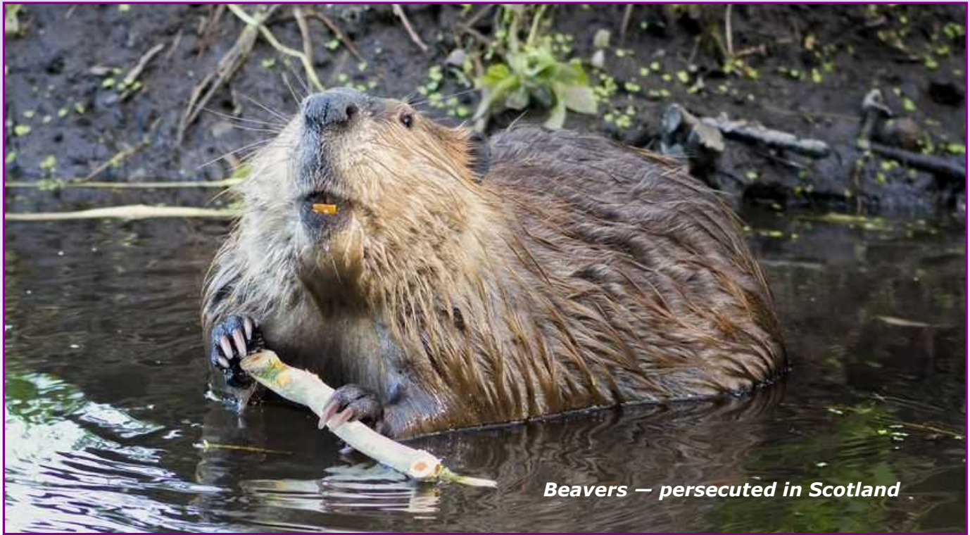
Beavers — persecuted in Scotland