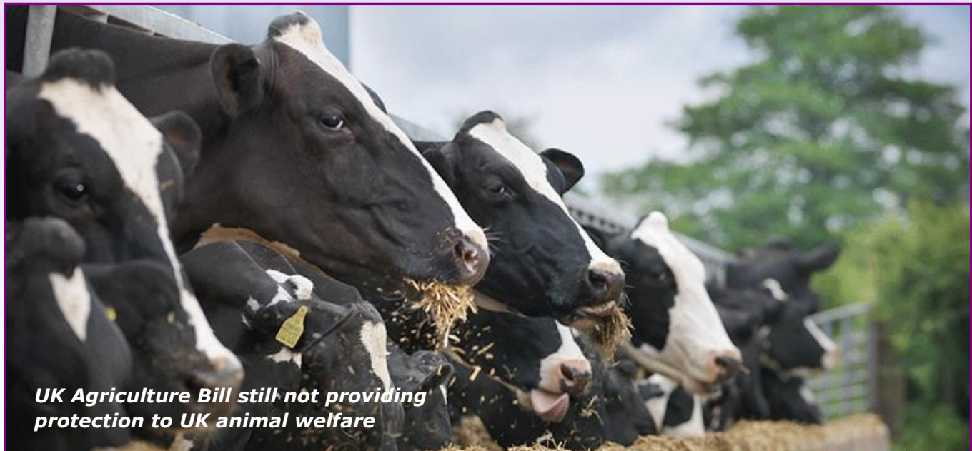
UK Agriculture Bill still not providing protection to UK animal welfare