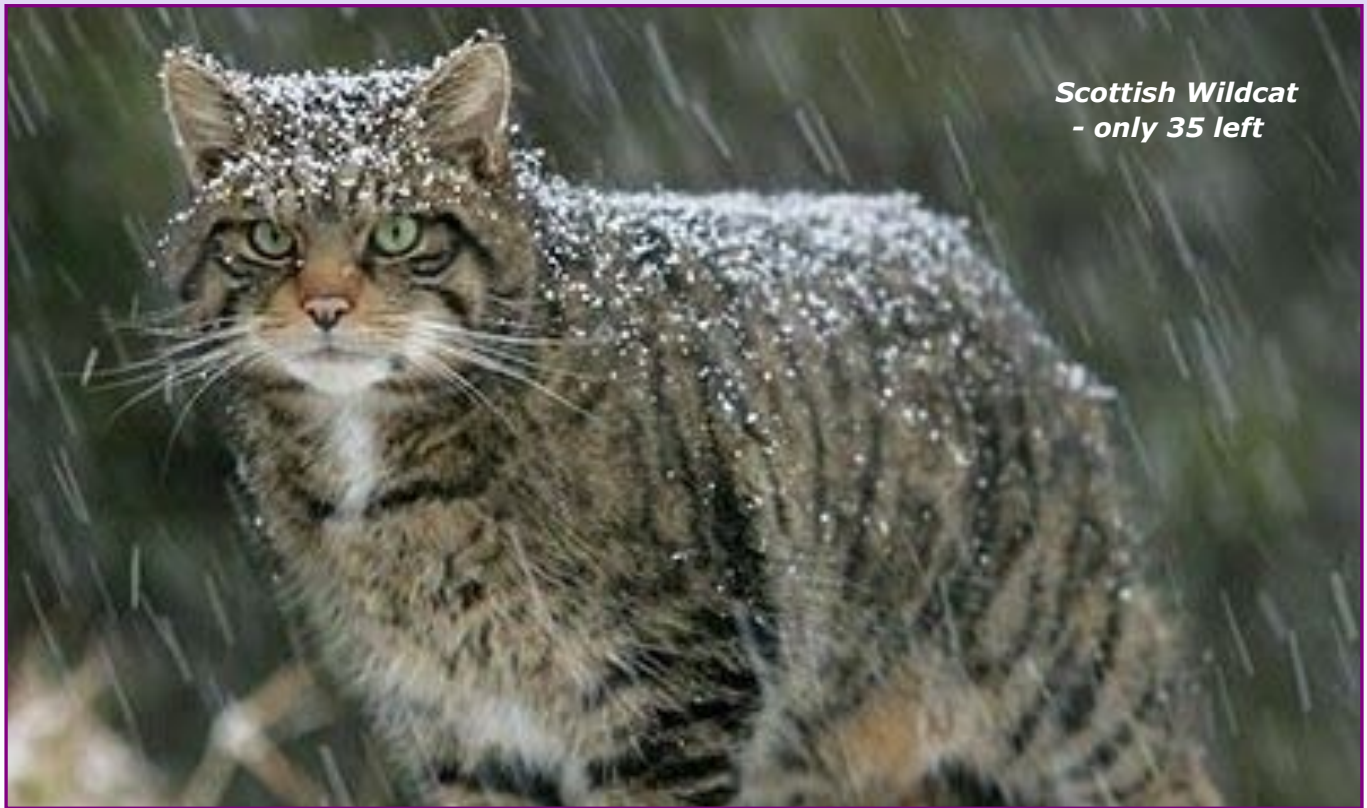
Scottish Wildcat - only 35 left